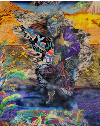
Jade Fenu, Dancing Chamane, acrylic on linen, 250x200cm

Slumberland , the inaugural exhibition of the space, by visual artist Jade Fenu , will grace the walls of the second space of 193 Gallery. A painting-poem, his dreamlike works approach the material in a constant search for balance, oscillating between strength and fragility. A universal narrative combining the abstract and the figurative: this series shows the abundance of reality and imagination while questioning the current issues of our society.